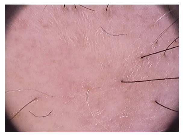
Figure 2B. White dots with irregular white and pink areas devoid of hair follicular openings.

topathological examination revealed perifollicular lamellar fibrosis, loss of sebaceous glands and a lichenoid lymphocytic infiltrate targeting the infundibulum and isthmus (Figure 3).