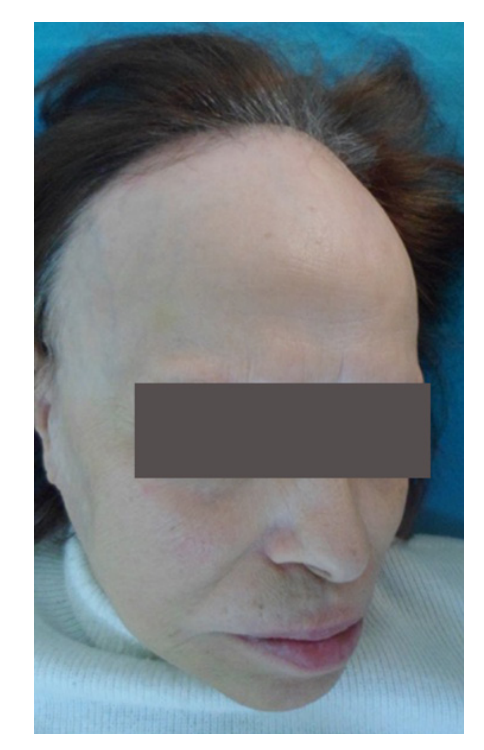
Figure 1. Scarring alopecia affecting the frontotemporal hairline.

A 69-year-old postmenopausal woman consulted for frontal hair loss for two years. She had started menopause at the age of 50 years old and had been taking bisphosphonates for her osteoporosis for two years. Her clinical history, including gynecological data, was otherwise negative. Anamnestic data ruled out the possibility of traction alopecia. Dermatological examination revealed a Fitzpatrick skin type III. She had a linear frontotemporal recession with perifollicular erythema, lonely hairs on the frontal region, and scarring alopecia (Figure 1). The patient had a total loss of eyebrows but she did not have body hair loss. There were no other skin or mucosal abnormalities. Thyroid hormone function was also normal. Dermoscopy with a non-contact polarizing FotoFinder dermatoscope x20 (FotoFinder Systems, Inc, Bad Birnbach, Germany) revealed perifollicular erythema and very mild perifollicular scaling in addition to hair shaft dystrophy and broken hair. Furthermore, dermoscopy noted the presence of white dots coexisting with irregular white and pink areas devoid of hair follicular openings (Figure 2). No prior topical treatment was used before our consultation. A 4 mm scalp punch biopsy from the frontal hairline was performed. His-