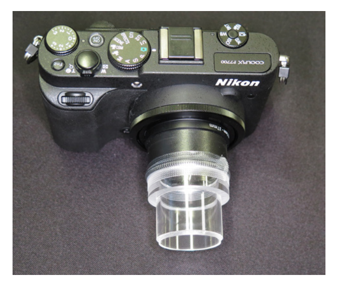
Figure 3. The typical structure of the dermoscope composed of a digital camera (COOLPIX P7700; Nikon, Japan), a macro conversion lens (MNS-202; Raynox, Japan), and a self-made transparent spacer. The macro conversion lens is mounted on the camera through a 40.5-37 mm step down ring (C-B-405a; Hassendo, Japan). The transparent spacer is taped to the tip of the conversion lens.

This dermoscope has potential advantages. In practical use, surgical light illumination improves the visual recognition of the skin lesion, especially at high-power fields. In research use, this dermoscope provides high flexibility in the selection of the light source, camera, macro conversion lens, and the design of the transparent spacer. The easy exchange-