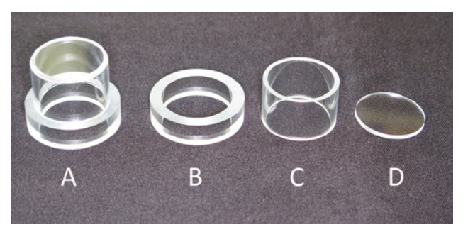
Figure 4. The transparent spacer (A) consists of three acrylic parts: a larger tube (B), a smaller tube (C), a disk (D) bound together with adhesive. (B) The larger transparent acrylic tube has a 40 mm outer diameter, 30 mm inner diameter, and 10 mm length. (C) The smaller transparent acrylic tube has a 32 mm outer diameter, 28 mm inner diameter, and 20 mm length. (D) The transparent acrylic disk has a 30 mm diameter, and 2 mm thickness.

ability of the tip part is considered favorable from the viewpoint of hygiene.