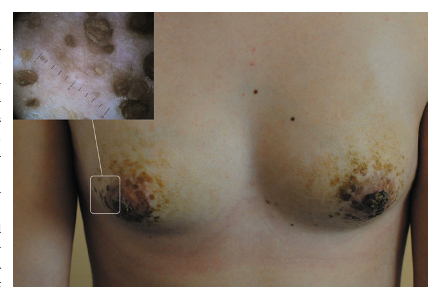
Figure 1. Clinical image of acanthosis nigricans-like lesions in a 20-year old woman. The lesions arose because she has avoided scrubbing the breasts. Diffuse velvety, hyperkeratotic, yellow, brown to black papules and plaques are seen on both nipples, areolae and surrounding breast area are seen. Insert: Dermoscopy of the keratotic papules and plaques shows focally arranged, structureless gray-brown, angulated keratotic clods.

A 20-year-old woman was referred to dermato-oncological surgery because of gradually expanding keratotic plaques on both breasts. The patient presented a fair skin phototype and normal body mass index. Her medical and family histories were unremarkable and she denied taking any medications. On clinical examination, symmetrically arranged, diffuse, yellowish to dark brown hyperkeratotic papules and plaques were bilaterally seen on the nipples, areolas and