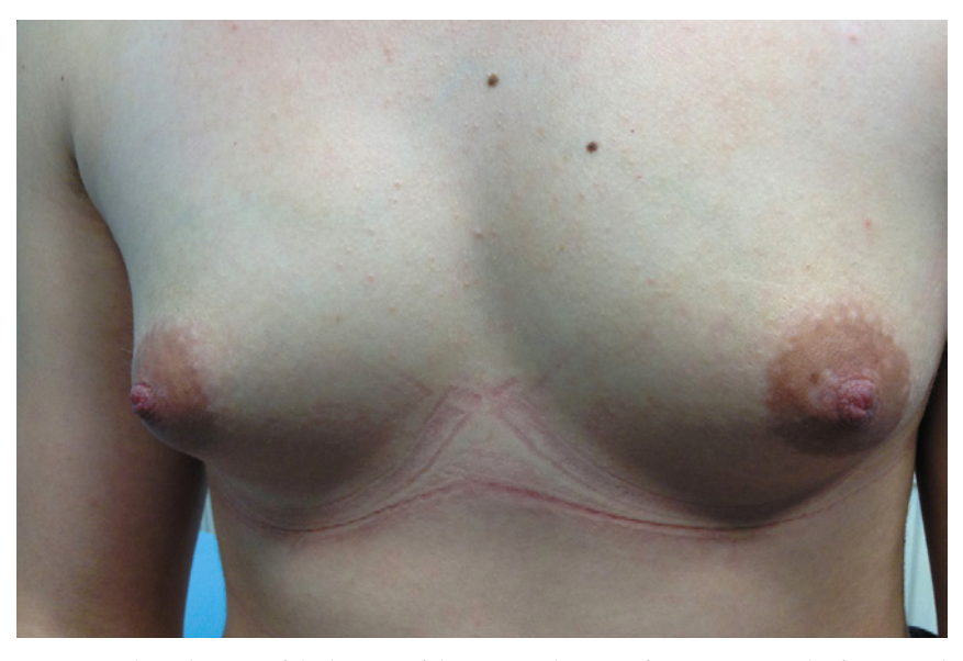
Figure 2. Clinical image of the breasts of the patient shown in figure, one month after topical treatment with keratolytic cream and hygienic teaching. Complete clearance of the keratotic papules and plaques is seen.

surrounding breast areas (Figure 1). No other body sites were affected. Dermoscopy revealed structureless black to yellowish keratotic clods (Figure 1 insert). Because the lesions were strictly limited to the breasts, the patient was interviewed in detail regarding her hygienic habits and in particular, whether she avoids scrubbing the breast area when taking a shower or drying with a towel; indeed, the patient confirmed that she avoids direct cleansing of the breasts due