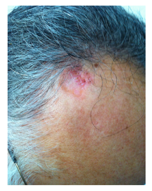
Figure 1. Erythematous to brown annular-like plaque with signs of atrophy at the center.

O'Brien's actinic granuloma is a chronic disease that affects middle-aged individuals of either sex who have a history of intense sun exposure [3]. It begins as small skin-