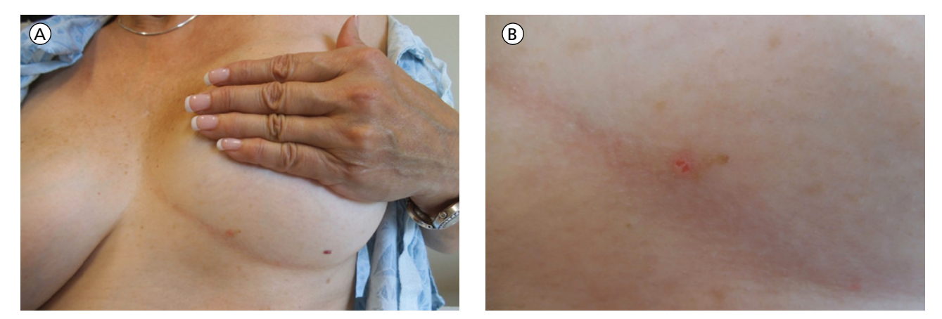
Figure 1. Distant (A) and closer (B) views of an acantholytic dyskeratotic acanthoma. The lesion appears as an erythematous plaque with central area of erosion.

dyskeratotic acanthoma and summarize the acantholytic dyskeratotic acanthomas (30 cutaneous and 3 subungual) that have been described in literature during the past 30 years.