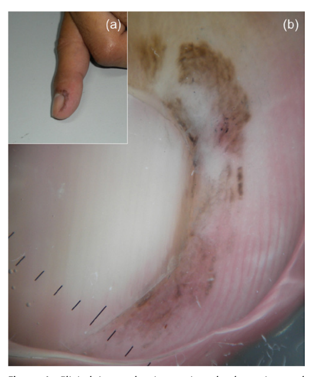
Figure 1. Clinical image showing an irregular hyperpigmented plaque on the second finger of the left hand (a). Dermoscopy showed a brown-colored area displaying a parallel pattern and a white-colored area in the proximal nail fold; in the distal part of the lateral nail fold and in the hyponychia, a slightly verrucous area with irregular light brown pigmentation was noted (b). Irregular pigmentation of acrosyringia was also observed (b, arrows).