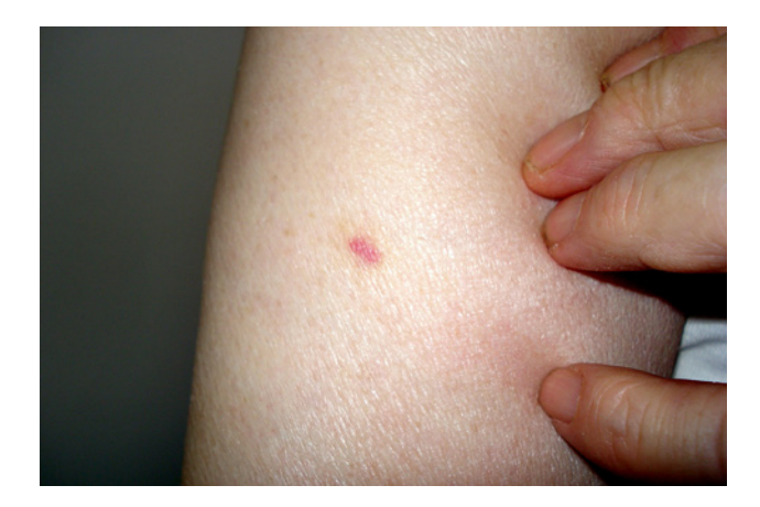
Figure 1. A purple papule in the right upper extremity.

A 54-year-old woman with immune thrombocytopenic purpura (ITP) referred to our dermatology department with a three-week-history of a purple-colored lesion on her right arm. The patient was on treatment with oral prednisone at 20 mg/day for ITP and levothyroxine at 25 mg/day for hypothyroidism. No topical treatment was prescribed or used before our consultation. Dermatological examination revealed a 12.5 x 7.5 mm solitary purple papule located on the right upper extremity (Figure 1). Dermatoscopic examination disclosed bluish-red coloration (Figure 2). Surgical excision of the lesion was performed. Histopathological examination of the lesion revealed nodular vascular proliferation in dermis, pronounced congestion and extravagated erythrocytes (Figure 3). What is your diagnosis?