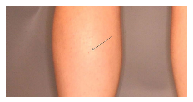
Figure 1. Melanocytic lesion in the right calf, measured 5 mm and dark-brownish in color.

She had a family history of malignant melanoma (in her father) and reported recent changes in a pigmented mole of unknown duration in her right calf. Upon examination, this pigmented lesion measured 5 mm in diameter, was dark brown in color (Figure 1) and displayed a homogeneous disorganized