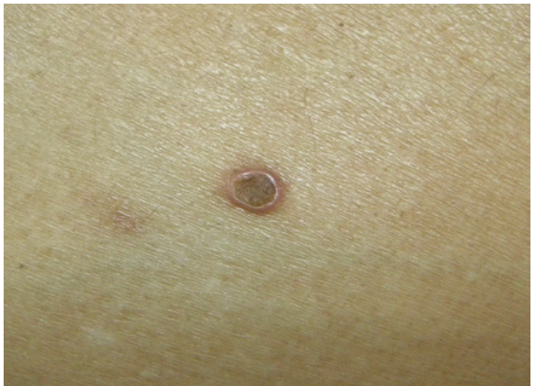
Figure 1B. A close up photo of the lesion.

Figure 2 Dermoscopy showing a vellowish-brown structureless