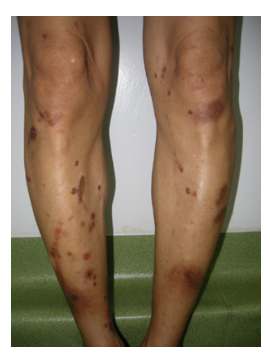
Figure 1A. Multiple ulcerated papules and plaques with yellowish crust on the upper and lower extremities.

A 46-year-old Thai woman presented with a one-month history of multiple pruritic ulcerated papules and plaques with yellowish crust on the upper and lower extremities (Figure 1). Differential diagnoses included prurigo nodularis, perforating granuloma annulare, factitious disorder, and