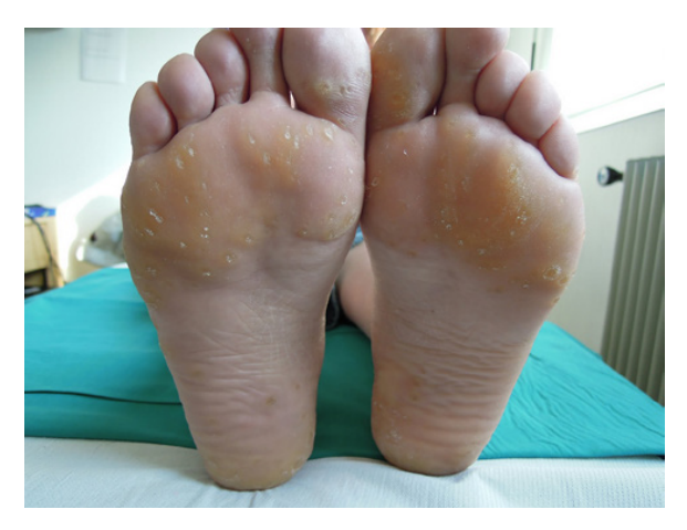
Figure 2. Numerous depressed pits of different sizes on the soles.

A 40-year-old white Caucasian woman presented with a 20-year history of asymptomatic lesions on palmoplantar regions. Physical examination revealed numerous keratotic papules with crateriform holes on the palms (Figure 1) and yellow pits over the areas of soles exposed to pressure (Figure 2). Her father reported the same skin signs but he was less severely affected. The patient displayed no systemic symptoms and chest x-ray and routine laboratory testing showed no alteration. No arsenic exposure was reported. Skin biopsy obtained from a lesion revealed marked orthokeratotic hyper-keratosis with hypergranulosis (Figure 3).