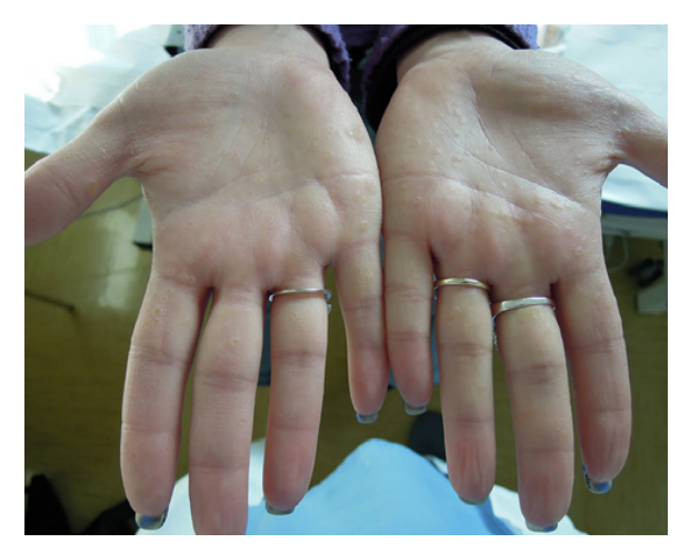
Figure 1. Multiple keratotic crateriform papules over the palms.