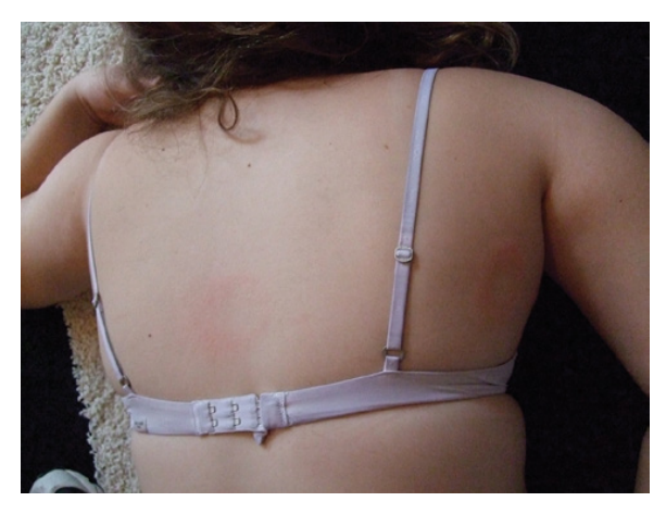
Figure 1. The "ball SITE (sports-induced targetoid erythema) sign" presenting as erythematous annular lesions surrounding normal-appearing skin at the sites of high velocity contact of a racquetball with the skin on the right upper flank and the upper central back of a 13-year-old female racquetball player.

high velocity contact from either a paintball, a ping pong ball, a racquetball or a squash ball to the skin.