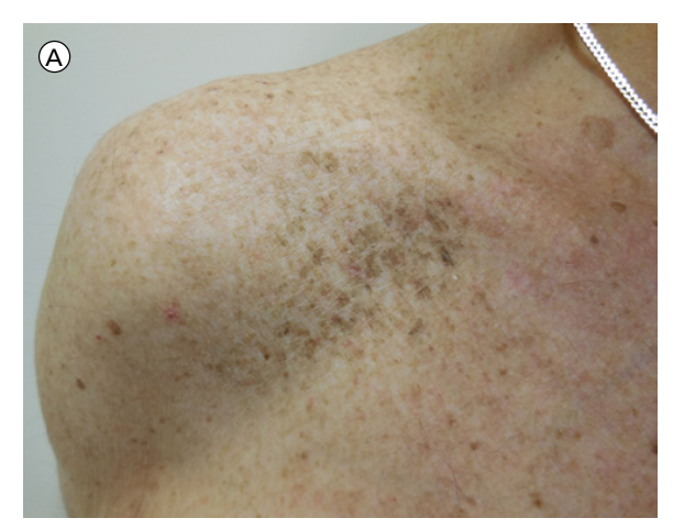
Figure 2. The initial appearance of a brown plaque on the subclavicular chest of an 86-year-old man (case 9) (A). Resolution of the brown plaque after rubbing with 70% isopropyl alcohol (B).

tomatic dermatosis. All patients practiced good hygiene and showered a minimum of every other day or daily. In addition, with the exception of one patient (case 4), all were capable of reaching the affected locations while showering. Most of the lesions (except case 6) were located on concave sites (Figures