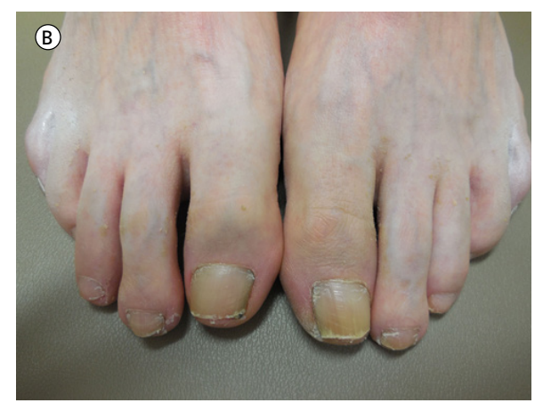
Figure 4. Clinical presentation of terra firma-forme dermatosis in a 58-year-old man (case 2). Brown plaques affecting the interspaces between the first through fourth toes, bilaterally (A). Clearing of terra firma-forme dermatosis after wiping with 70% isopropyl alcohol pads (B).