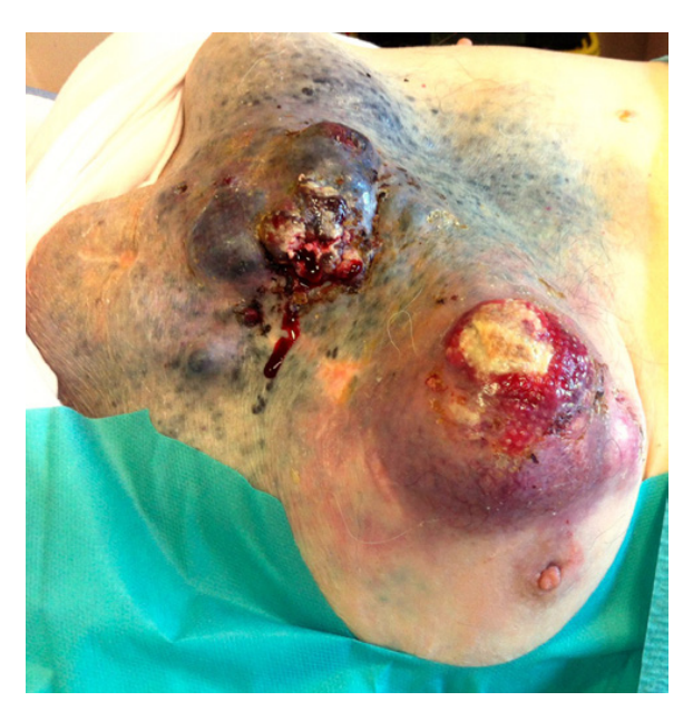
Figure 2. Rapid increase of two of the subcutaneous nodules with ulceration. [Copyright: ©2015 Savoia et al.]

We decided to repeat a skin biopsy of a subcutaneous nodule, and the histopathology was consistent with a benign cellular blue nevus, while the revision of the previous biopsy confirmed the diagnosis of melanoma on a congenital blue nevus