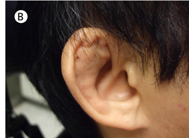
Figure 1 (a, b, and c). Distant (a), intermediate (b), and close (c) views of the right ear show a 3.0 x 2.0 centimeter pseudocyst of the auricle in a 33-year-old Asian man with spinocerebellar ataxia.