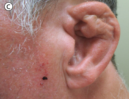
Figure 2 (a-e). Posterior (a), oblique (b), and side (c) views of a flesh-colored pseudocyst of the auricle measuring 4.0 x 2.0 centimeters can be seen projecting from the left ear of a 47-year-old Caucasian man with Friedreich's ataxia. Posterior (d) and side (e) views of the patient's unaffected right ear show normal auricular structure.