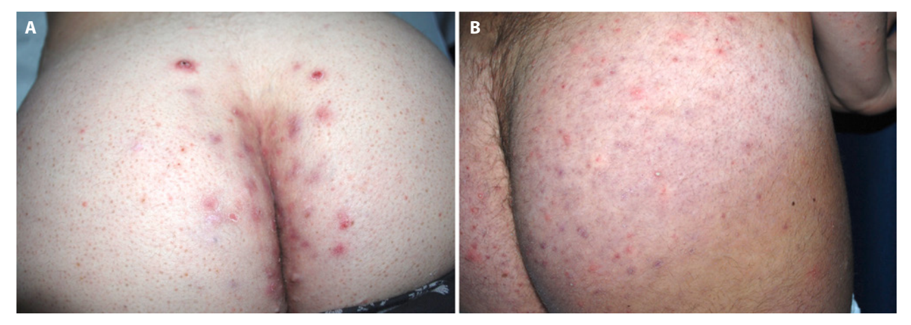
Figure 1. Clinical presentation of HS and DRF in patients carrying trisomy 21. (A) Painful suppurating nodules were detected in close proximity of the intergluteal fold, while the lateral aspects of the buttocks display signs of diffuse folliculitis in an HS+F+ patient. (B) Case of HS–F+ with the gluteal involvement of DRF presenting with active follicular-based papules and pustules, in the absence of inflammatory nodules, abscess, sinus tracts, or scarring.