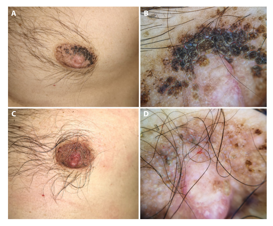
Figure 1. Clinical and dermoscopic overview of the lesion before (A, B) and after (C, D) curette removal. Brown, warty, keratotic plaque on upper portion of left areola (A), showing polygonal and angulated clods with a keratotic, shiny blackish surface on dermoscopy (B).

distinct entity or a clinical presentation of other dermatoses [2]. In practice, it is a morphological diagnosis that depicts a unilateral or bilateral brown keratotic plaque on the nipple and/or areola. The idiopathic type is usually known as nevoid hyperkeratosis of the nipple and is more common in women after puberty. However, this entity is questioned and most authors point out that hyperkeratosis results from other dermatoses. Differential diagnosis includes acanthosis nigricans, seborrheic keratosis, and epidermal nevus and, rarely, malignant tumors such as pigmented squamous cell carcinoma, Paget disease, and melanoma may mimic this condition. Some cases have been associated with endocrinopathies or estrogen hormonal treatment [2] and, recently, with BRAF inhibitor therapy [3].