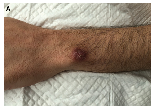
Figure 1. (A) Crusted nodule on the left forearm. (B) Small orange structureless areas associated with white scaling, erosions, sero-hematic crusts, and dotted/glomerular vessels.