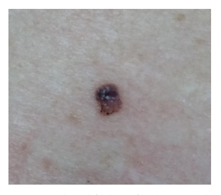
Figure 1. Clinical finding of malignant melanoma: asymmetrical, nonulcerated, 5 mm in diameter, and slightly elevated with 3 different colors (dark brown, light brown, and gray).

Carrera C, Segura S, Aguilera P, et al. Dermoscopic clues for diagnosing melanomas that resemble seborrheic keratosis. JAMA Dermatol. 2017;153(6):544-551.