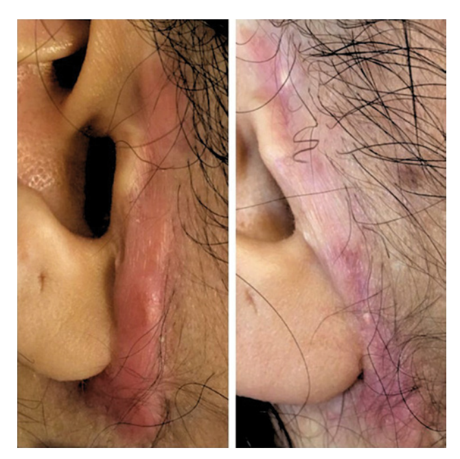
Figure 2. Before and after photographs of a patient in the triamcinolone group.