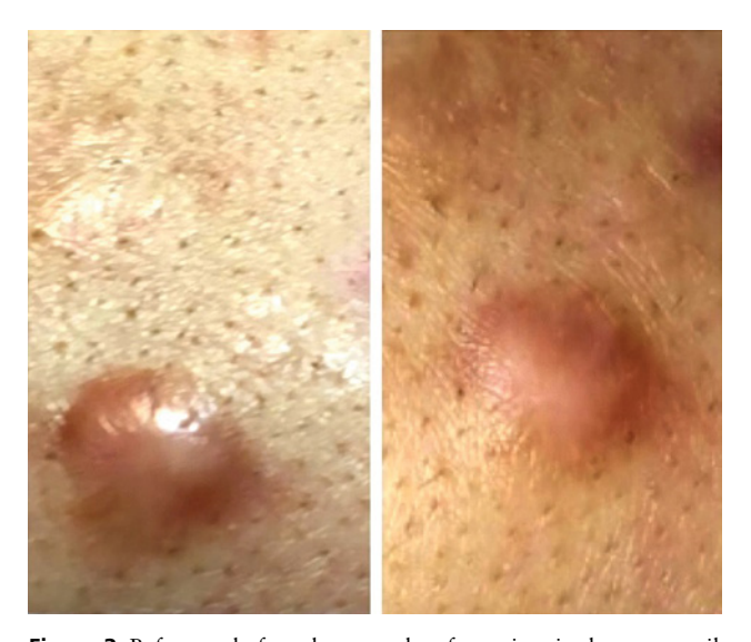
Figure 3. Before and after photographs of a patient in the verapamil group.

hence, it can be a suitable alternative to triamcinolone for treatment of hypertrophic scars and keloids [5]. Ahuja and Chatterjee showed that a faster rate of improvement in scar height, vascularity, and pliability is achievable with triamcinolone. However, the difference in the rate of pigmentation change by the 2 agents was not statistically significant [6].