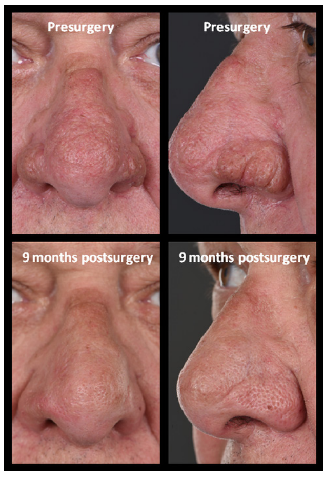
Figure 2. Pre- and post-surgery photographs of Patient 2 with rhinophyma treated with scanner-assisted carbon dioxide laser. Note that this patient was independently operated on.

laser. The knowledge added by this report is three-fold: 1) we demonstrate that this method can be easily learned; 2) we show that even after decades of progression, rhinophyma can be treated successfully; and 3) we provide an instructive photographic timeline of rhinophyma development. While we did not compare scanner-assisted carbon dioxide laser to other methods, other authors have noted that scanner-assisted carbon dioxide laser treatment requires less training,