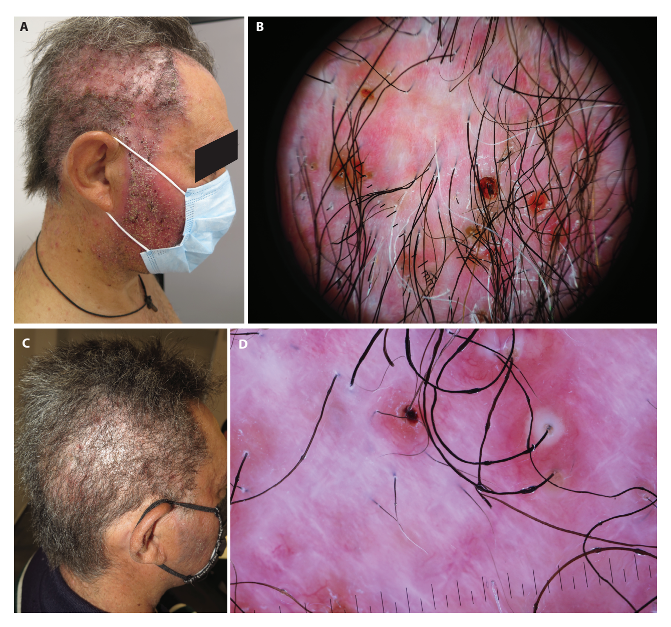
Figure 1. (A) Scarring alopecia with erythema, pustules, crusts, and pili torti in a 57-years-old patient. A similar dermatitis was present also on the face, especially in the beard area. (B) Trichoscopy of the same patient, showing lack of follicular ostia, yellowish serum crusts and reddish hemorrhagic crusts. (C) Clinical picture of the same patient after one month of treatment showing a good improvement of the inflammation. (D) Trichoscopy of the same patient, showing absence of inflammatory signs.