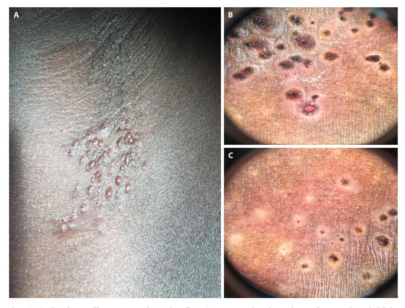
Figure 2. (A) Clinical image of herpes zoster involving right axilla. (B,C) Dermoscopy shows brownish crusts that cover white polyglobular structures on skin of color (Halo sign).