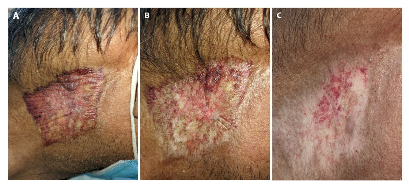
Figure 2. Results after topical calcitriol 0.0003% ointment application. (A) Pretreatment. (B) After 2 weeks of treatment. (C) After 4 weeks of treatment.

histopathological section was negative for acid fast bacilli. Skin biopsy CBNAAT was negative for mycobacterium tuberculosis. A final diagnosis extragenital LSA-morphea overlap was