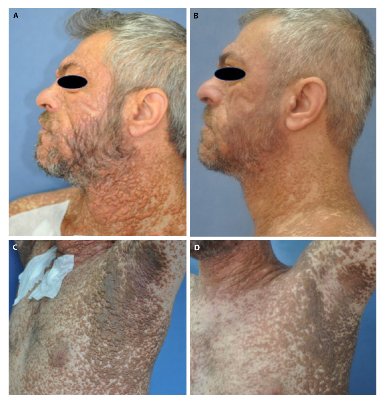
Figure 1. The appearance of lesions before (A,C) and after (B,D) treatment with 2-chlorodeoxyadenosine.

Histopathological and immunohistochemical findings of the specimen obtained through transurethral resection of the bladder were also consistent with XD (Figure 2, D and E).