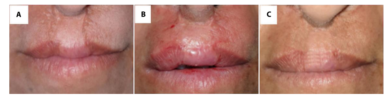
Figure 4. Clinical case 2. (A) Before treatment; (B) Immediately after microneedling; (C) After 1 month of the final microneedling process.