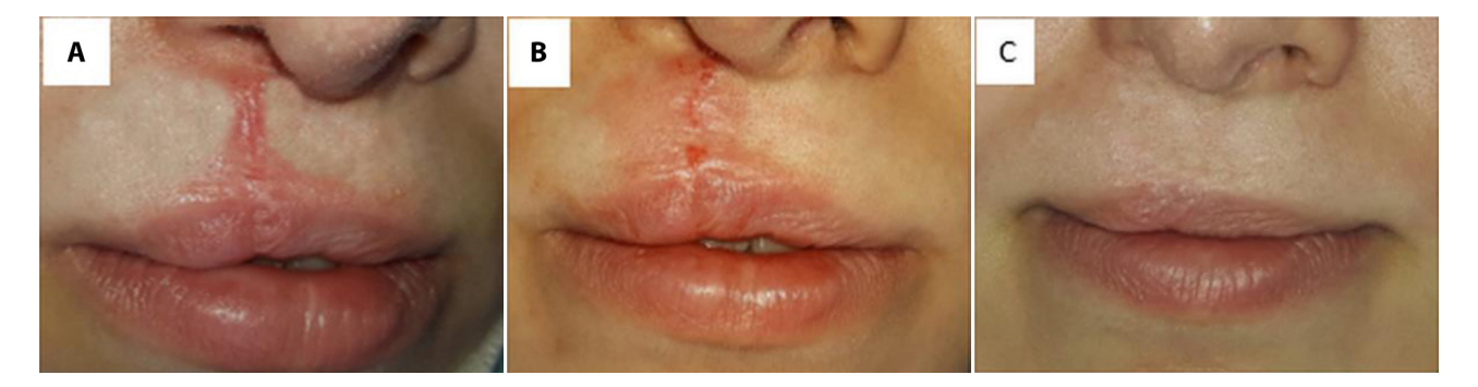
Figure 5. Clinical case 3. (A) Before treatment; (B) Immediately after microneedling; (C) After 1 month of the final microneedling process.