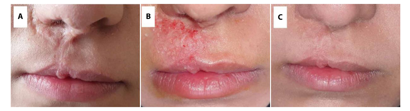
Figure 3. Clinical case 1. (A) Before treatment; (B) Immediately after microneedling; (C) After 1 month of the final microneedling process.