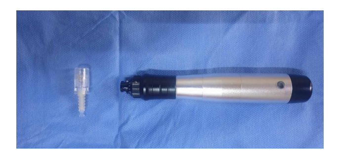
Figure 1. The automated microneedling Dermapen.

The treatment was divided into 4 sessions with an interval of 3 weeks. The surface of scar was cleaned well with 0.10 ml Hexamidine solution, then a local anesthetic cream (EMLA) was applied for 20 minutes. After that an oil-based hyaluronic substance with a concentration of 3.5% and formulated from a mixture of hyaluronic acid of non-cross-linked biotechnological origin was applied to the skin surface. The dermapen was applied to the scar with a prick depth of 2-2.5 mm and speed of 5 pricks per second, depending on the device instructions for the treatment of scars. Finally, the surface of the scar was cleaned with a piece of sterilized gauze soaked in saline solution and a steri-strip bandage was applied (Figures 2 and 3). Additional images