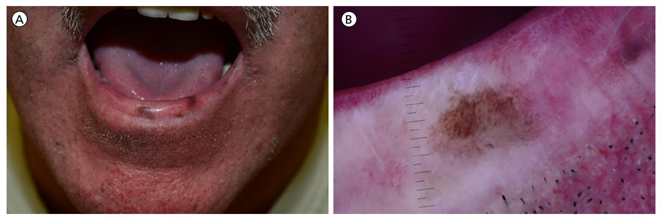
Figure 1. (A) Clinical manifestations of the pigmented macules of the lower lips, (B) dermoscopic examination of the pigmented lesions reveals a fish scale-like pattern.