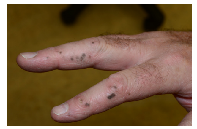
Figure 3. Clinical manifestations of the pigmented macules of the lateral aspects of the second and third right finger.

patient's history was significant for melanoma in situ which was treated five years prior to the onset of the pigmentation of his lips and fingers. The patient was a non-smoker and he had no other relevant medication history. The patient denied a history of trauma or exposures to heavy metals. There was no familial history of pigmentary disorders and digestive polyposis or tumors.