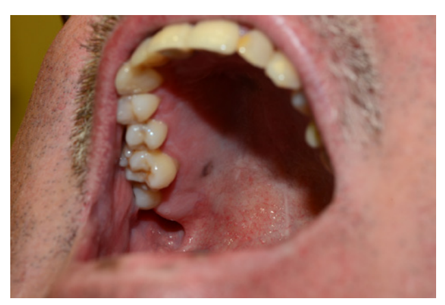
Figure 2. Clinical manifestations of the pigmented macules located on the hard palate.