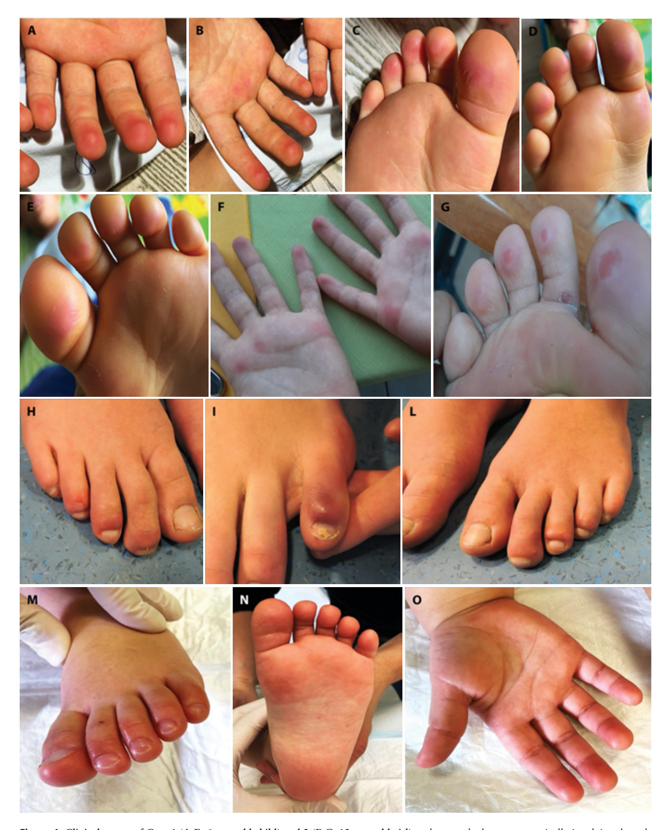
Figure 1. Clinical aspect of Case 1 (A-E, 6-year-old child) and 2 (F-G, 13-year-old girl): redness and edema symmetrically involving the palmar (A,B,F) and plantar (C,D,E,G) surface of all the distal phalanges of the feet and hands, with the sole exception of the fifth toe; the palms of the hands and feet, in correspondence with the metacarpophalangeal and metatarsophalangeal joints, are also partially affected in case 1. Vesicle-bullous evolution is possible in areas subject to friction on rough pool surfaces (G). Clinical aspect of Case 3 (H-L, 13- and 15-year-old girls) and 4 (M-O, 3-year-old girl): Chilblain-like edematous and erythematous lesions involving the feet, on the dorsal surface (H-I-L), or both on the palmar-plantar and dorsal side (M-N-O). Note the presence of exulcerations on the third and fourth toes (H, L).