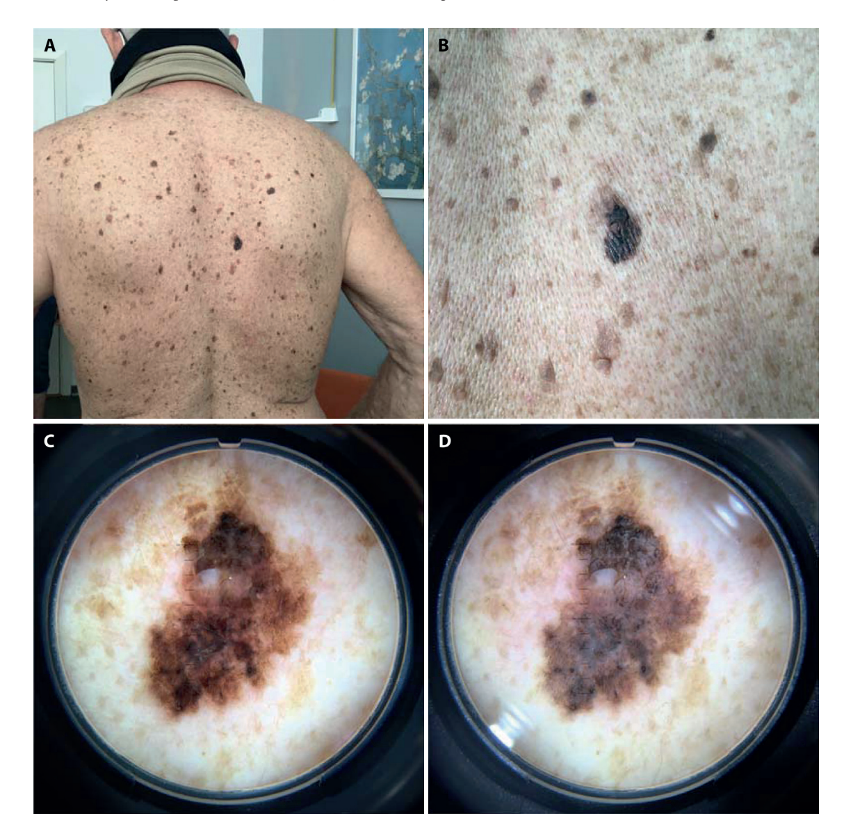
Figure 2. Photographs of a teledermatoscopy case. (A) An overview, (B) a close-up, and two dermatoscopic images ((C) polarized, (D) unpolarized) are collected and uploaded in the mobile application together with background information. Histopathologic diagnosis: Lentiginous malignant melanoma in situ described in pathology report as an extensive atypical junction melanocytic proliferation, lentiginous and nested, with frequent rete fusion, multifocal pagetoid upgrowth and early involvement of adnexal structures. The lesion focally blends with areas of seborrheic keratosis-like epidermal reaction and a small benign intradermal nevus is noted at the periphery of the main lesion.

Figure 1. Process of mobile teledermatoscopy as used in the project. The primary care physician examines the patient, takes clinical and dermatoscopic images (A and B), and fills in clinical information which is then packaged together in the mobile app and sent encrypted to a database.