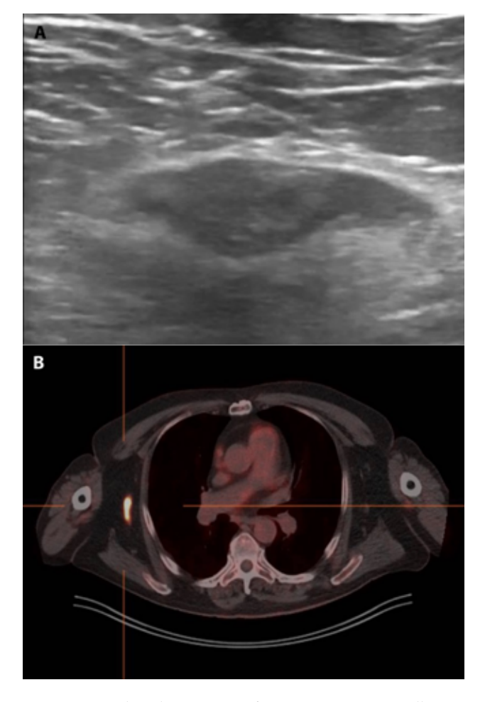
Figure 2. Lymph node metastasis of cutaneous squamous cell carcinoma on the right arm. (A) Regional ultrasound shows a 17 mm hypoecoic structure also identified in the PET-CT scan. (B) The patient undewent right axillary lymph node dissection.

However, over the last decade, a trend towards the consideration and offer of less extensive and more selective lymph node dissections has developed, with cSCC patients. The few available studies on selective neck dissections have shown regional control and survival rates of 85%–100%, rates similar to those reported for conventional radical and modified radical neck dissections [37, 38]. Thus, selective neck dissection appears to provide an oncologically effective and safe surgical procedure for those patients with clinically positive nodes in the neck and with no other high-risk clinical