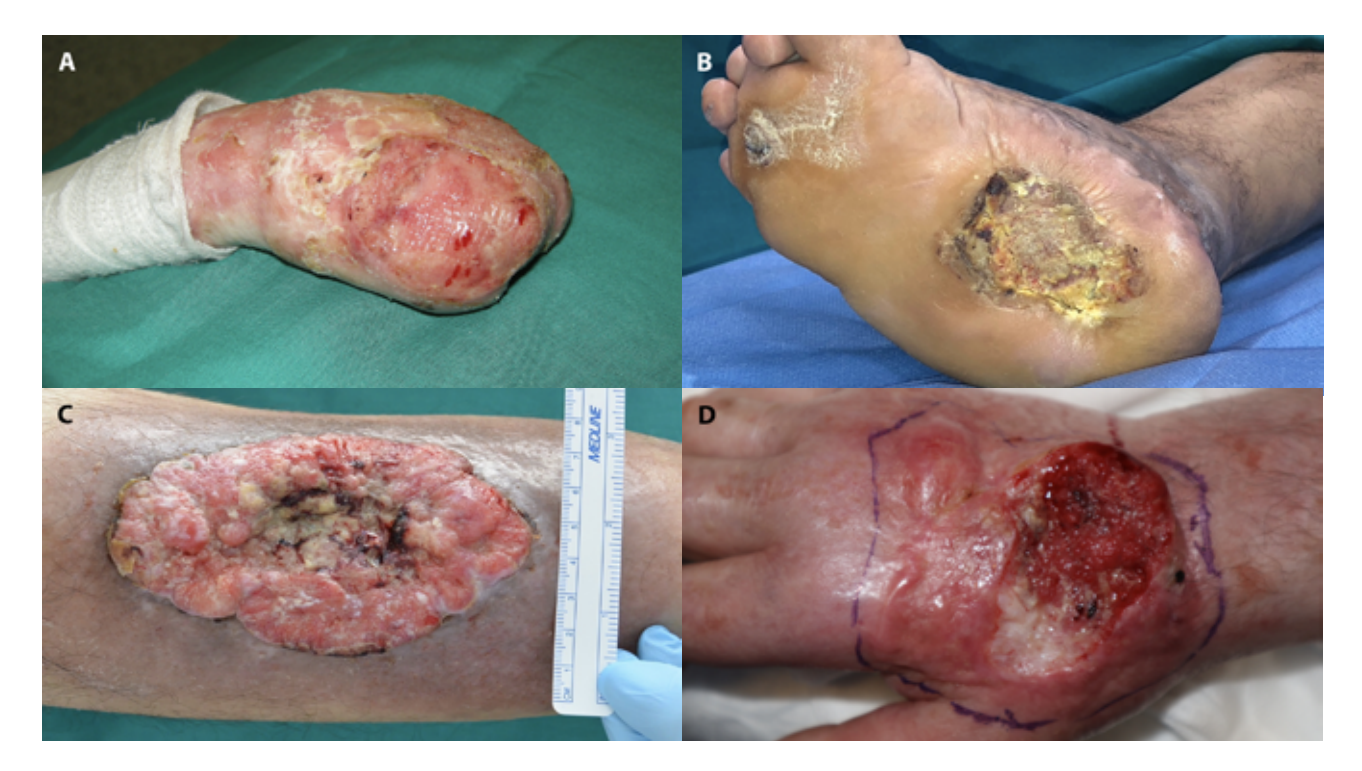
Figure 5. Advanced cutaneous squamous cell carcinoma (cSCC). (A) A 32-year old man with dystrophic epidermolysis bullosa who developed an unresectable cSCC over a chronic wound on the left hand stump. The patient underwent amputation. (B) A 50-year old man with polyomelitys who developed an unresectable cSCC over a chronic ulcer on the right sole. The patient refused radiation therapy and systemic immunotherapy and a lower leg transtibilial amputation was carried out. (C) A 70 year-old woman who developed a neglected 10-year history ulcer on the right leg tha was considered unresectable. Radiation therapy achieved partial response and knee disarticulation had to be performed. (D) A 70-year old man immunosuppresed due to kidney grafting who developed fast-growing ulcer on the right hand. Systemic immunotherapy and radiation therapy did not achieved clinical response and consequently the patient underwent major amputation.

However, there are still 3 situations for patients with advanced cSCC in which surgery is likely to play a significant role. The first is when the patients are undergoing immunotherapy or other systemic therapies and develop further resectable recurrences. Determining the appropriate therapy for those cancers for which immunotherapy is available should be a dynamic process far from the classical binary