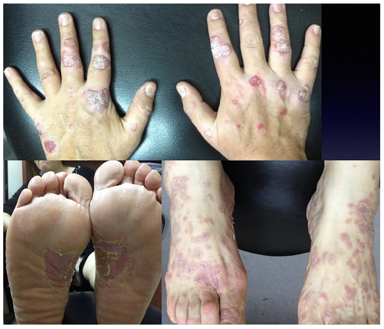
Figure 1. Lichen planus. Erythematous plaques covered by silvery-whitish scales. Both the clinical morphology and the distribution of the skin lesions are indicative of psoriasis.

tumors [7,8]. However, cumulative evidence suggests that dermoscopy is also meaningful for the evaluation of inflammatory and infectious skin disorders [7,9]. In the field of papulosquamous dermatoses, dermoscopy has been shown to enhance the differential diagnosis among psoriasis, dermatitis, LP and pityriasis rosea [7,10]. Particularly for LP, dermoscopy brought to light that white crossing lines do not characterize only mucosal lesions, but cover virtually every cutaneous papule of active LP [7]. In this report we present a characteristic example of a patient with misleading clinical manifestations of LP resembling psoriasis. Application of dermoscopy was the key point guiding to the accurate diagnosis [11].