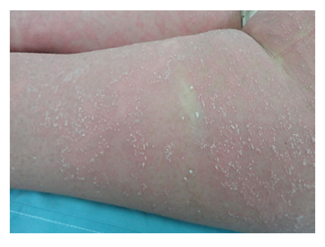
Figure 1. Diffuse erythema with multiple small pustules.

marked neutrophilia and skin biopsy was consistent with AGEP. Diagnosis was defined following EuroSCAR criteria. Patch testing with the component of the commercialized package of goldix day (30 % pet.), goldix night (30 % pet.) and paracetamol (50% pet.) was performed. The patch test preparations were applied in IQ Ultra (Chemotechnique Diagnostics). The patch tests were occluded for 48 hours, and readings were performed according to ICDRG/ESCD criteria on day 2 and day 4. Patch testing showed a ++ skin reaction to goldix day and goldix night, but was negative to paracetamol (Figure 2). The oral provocation test to paracetamol was also negative. The constituent dextromethorphan was not available for testing, but was suspected as the cause of the reaction as it was the only compound in common besides