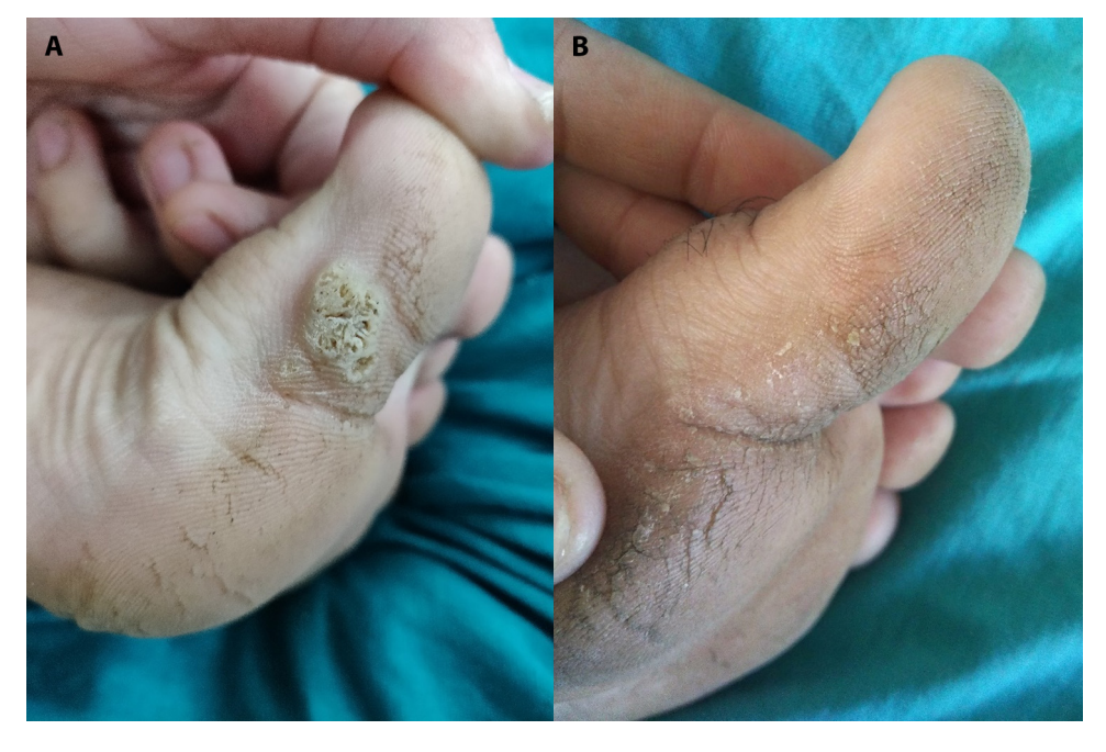
Figure 6. (A) Plantar warts at baseline. (B) Complete resolution after 4 doses of PPD tuberculin