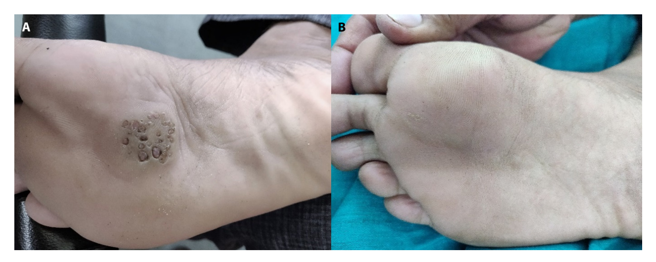
Figure 4. (A) Multiple myrmecia wart at baseline. (B) Complete resolution after 4 doses of Mw vaccine.