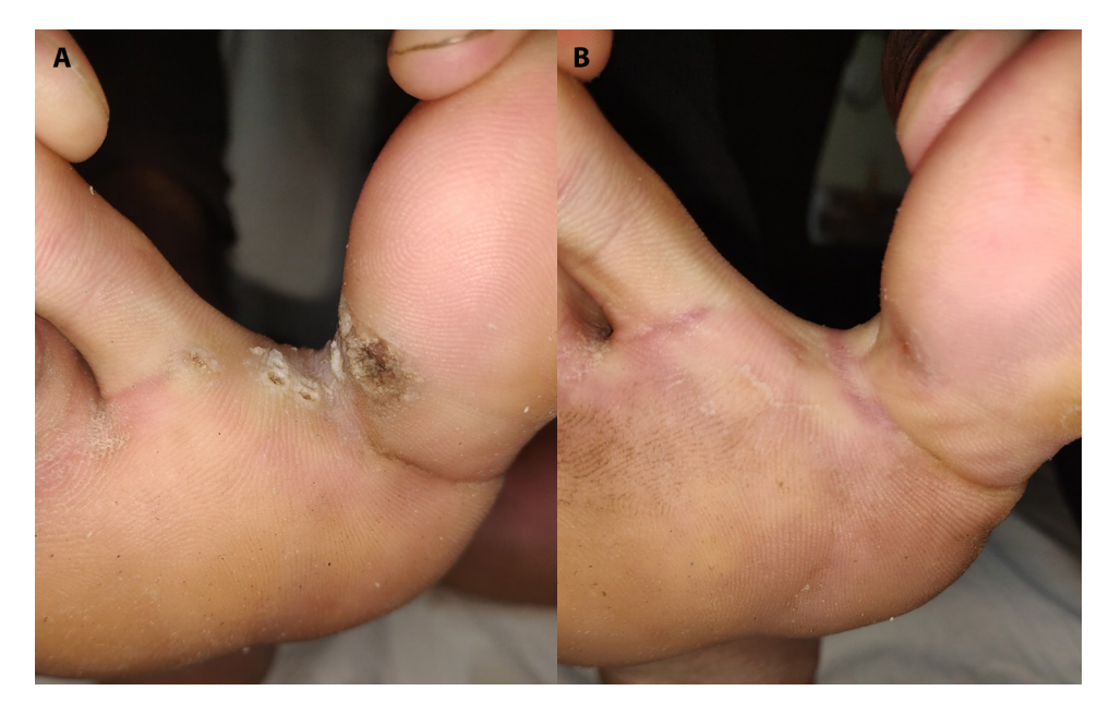
Figure 5. (A) Multiple interdigital warts at baseline (B) Complete resolution after 2 doses of PPD tuberculin.