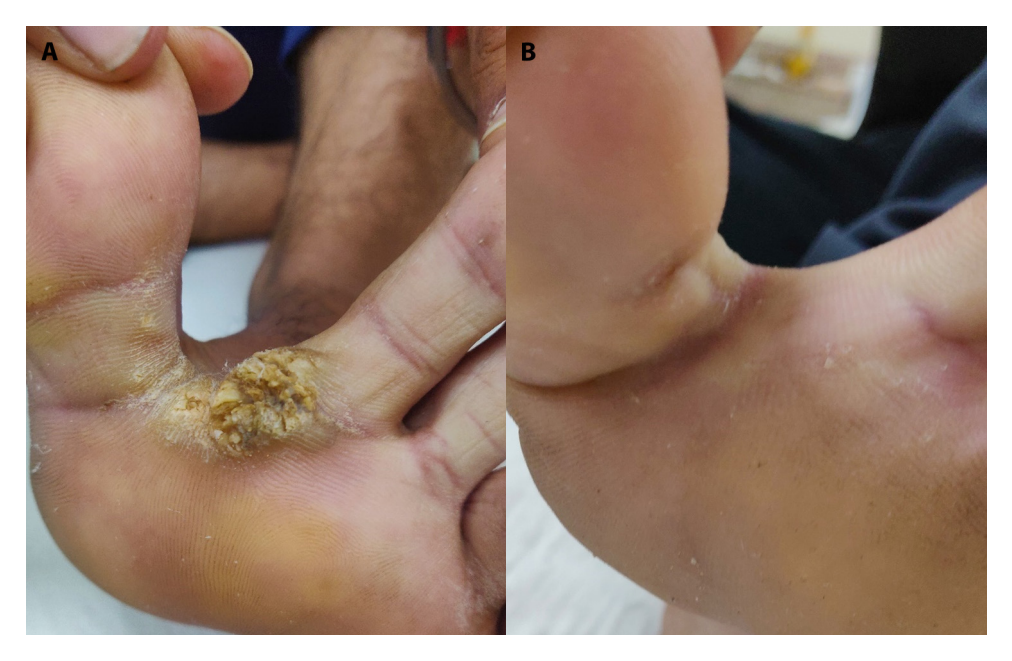
Figure 3. (A) Multiple interdigital warts at baseline. (B) Complete resolution after 4 doses of Mw vaccine.