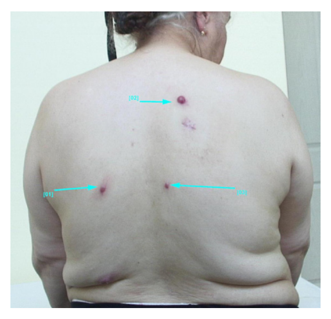
Figure 1. Multiple pink nodular lesions of a few millimeters and centimeters in diameter on chest and back.

nations. We present a case of primary cutaneous CD 30 (+) anaplastic large cell lymphoma assessed by dermoscopy that responded very well to local radiotherapy.