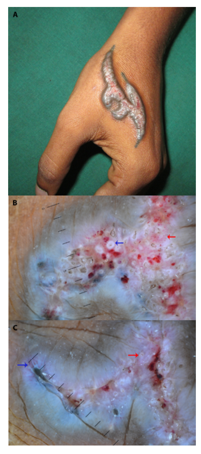
Figure 1. (A) Solitary erythematous to bluish verrucous plaque over the tattoo. (B) Dermoscopic examination under nonpolarized mode (HEINE DELTA20®, 10X magnification) shows white scales, white to pinkish-white structureless area, comedo-like opening with keratotic plugging, white circles (blue arrow), red globules, hemorrhage, and linear irregular vessels (red arrow). (C) The peripheral zone shows a gray-white to bluish-white structureless area and hairpin vessels (blue arrow). Red arrow points white circle.

benign reaction pattern commonly to red or purple pigment. Differentiating PEH from squamous cell carcinoma (SCC) is vital to reduce patient morbidity and cosmetic disfigurement, as the latter can occur independently over