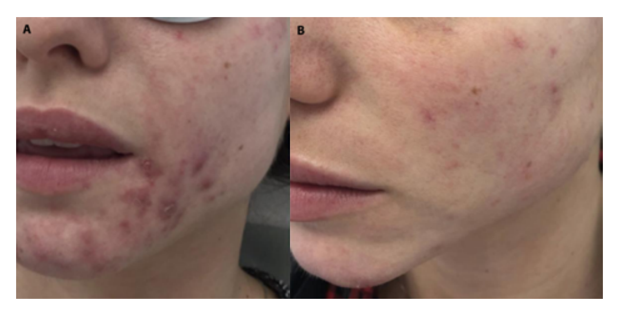
Figure 1. Clinical pictures of a 34-year-old woman. (A) Before the last erbium:YAG laser session. (B) 3 months after the last erbium:YAG laser session, showing the reduction of active acne lesions.

Acne is one of the most common skin diseases. Many therapeutic approaches are currently available for active acne, including laser treatments. However, the role of resurfacing