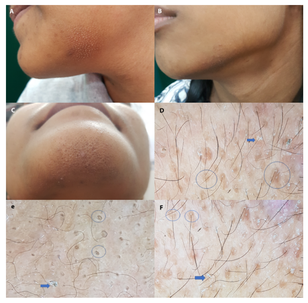
Figure 1. Clinical images show: (A) grouped follicular, skin-colored papules on the left jawline; (B) grouped follicular papules on left jawline; and (C) grouped follicular papules on chin and jawline. Dermoscopy of anserine folliculosis shows: (D) white scales (blue arrow), patulous follicles and yellow dots (blue circle) (DermLite DL4, polarized, ×10); (E) white scales (blue arrow), patulous follicles and yellow dots (blue circle) (DermLite DL4, polarized, ×10) and (F) white scales (blue arrow), patulous follicles and yellow dots (blue circle) (DermLite DL4, polarized, ×10).

not found in all cases. The presence of atopy has been linked to the incidence of anserine folliculosis. Dermoscopic signs have not been elucidated to date. Histopathological features include epidermis with hyperkeratosis, hypergranulosis, the focal presence or increase of the stratum lucidum, rudimentary follicles, and dilatation of follicular openings with retention of keratotic material [1]. Hyperkeratosis corresponds to white scales on dermoscopy and dilatation of follicular openings with retention of keratotic material corresponding to patulous follicles and yellow dots. This condition can be compared to its close differentials, lichen nitidus, and keratosis pilaris. The absence of histopathological analysis is a limitation in our case series.