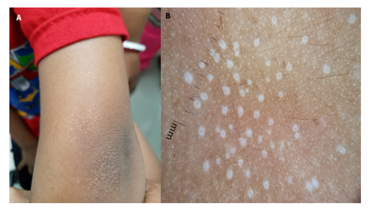
Figure 2. (A) Clinical image shows grouped shiny white papules on the left elbow. (B) Dermoscopy of lichen nitidus shows a white structureless area with a central brown area (blue circle). These structures interrupt underlying skin markings (DermLite DL4, polarized, ×10).