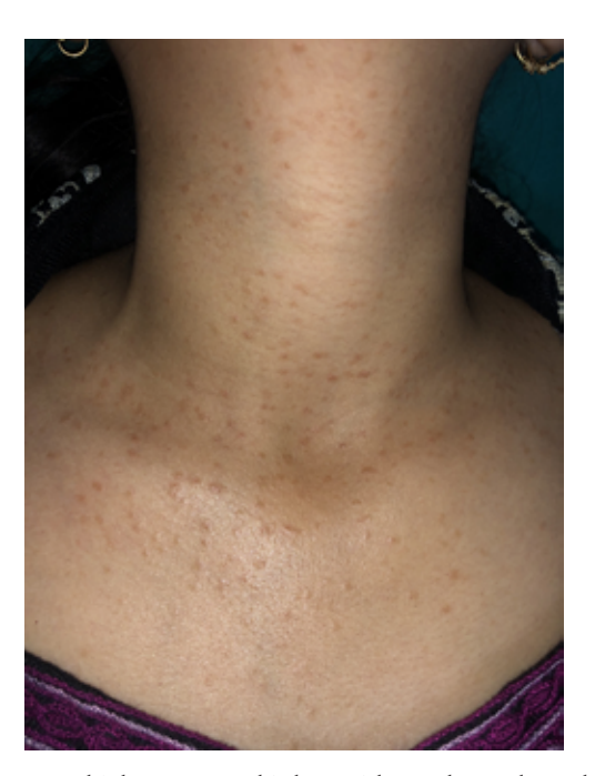
Figure 1. Multiple monomorphic brownish papules on the neck and upper chest.

A woman in her late twenties presented with a 7- to 8-year history of asymptomatic papules on the neck. The papules developed episodically, in clusters (Figure 1). She had no history of chronic disease and no family history of a similar condition. Physical examination revealed multiple monomorphic brownish papules on the anterior part of the neck and chest. Routine laboratory tests, including lipid profile and serum thyroid hormone levels, were all normal.