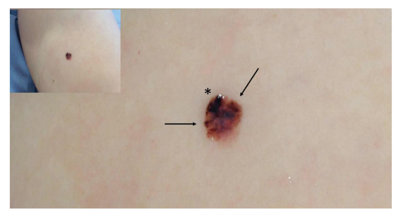
Figure 3. Enlarged image on screen revealed morphologic features of eccentric streaks (arrows) and an eccentric hyperpigmentation (*) with dark brown and black colors; histologically an early invasive melanoma (tumor thickness 0.4 mm) was confirmed.

Two cases demonstrate this simple technique: