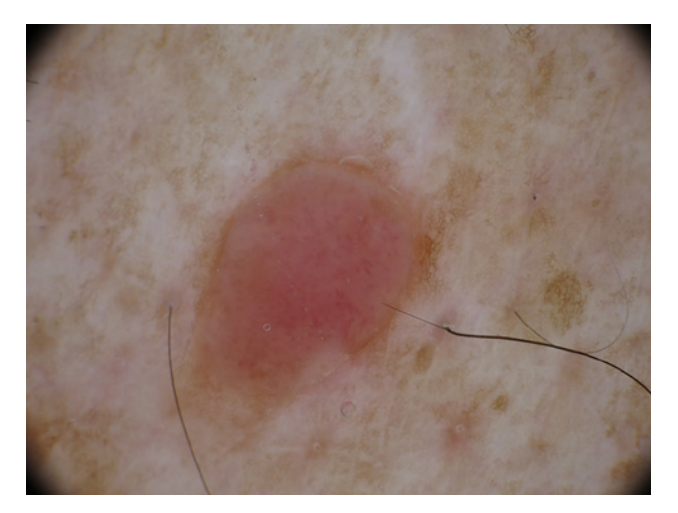
Figure 2. Superficial angiomyxoma. Dermoscopic image.