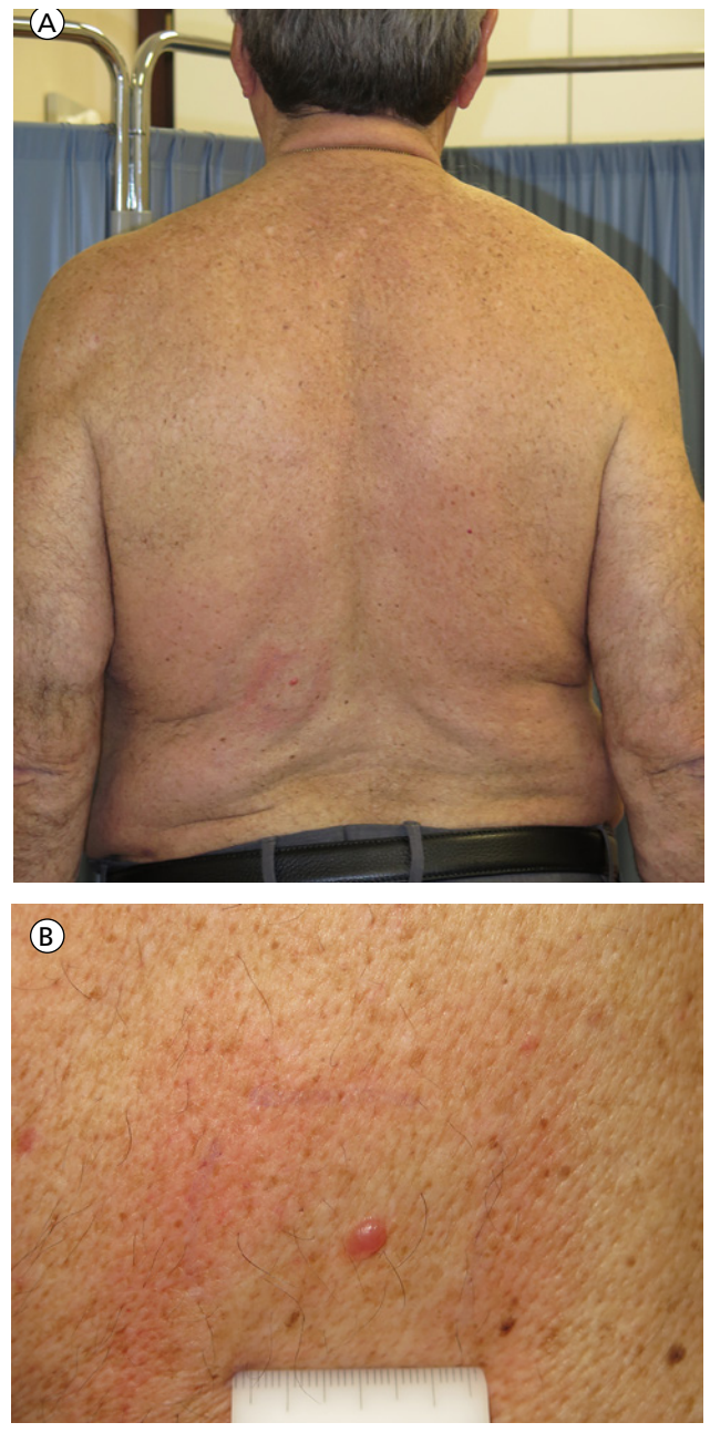
Figure 1. Superficial angiomyxoma. Clinical images.