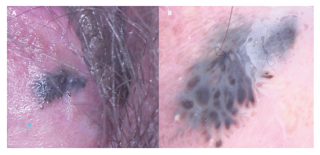
Figure 1. (A) Clinical appearance: oval papule, brown-black in color, intensely pigmented, about 1 cm in size. (B) Dermoscopy: many irregular, black blotches surrounded by a whitish blue veil. No atypical vascular feature was detected.