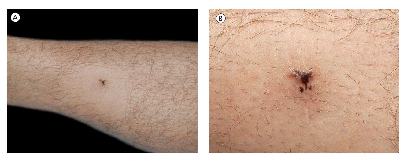
Figure 1. (A) Clinical picture of a small brown papule. (B) Clinical closeup.

A 30-year-old male patient presented with a small, brown papule on the calf (Figure 1). By dermatoscopy one can see radial lines in some segments at the periphery and skin- colored and pink structureless zones (Figure 2). What is your diagnosis?