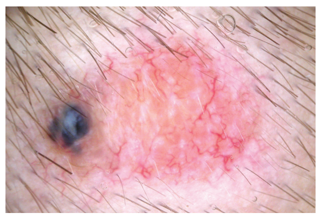
Figure 2. Dermatoscopy: A structureless yellow to orange area, a single blue clod, and serpentine branched vessels can be seen.