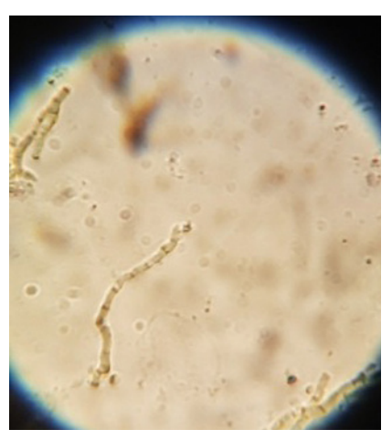
Figure 3. Mycological examination: dematiaceous septate and branched hyphae.

patch [1]. However, Noguchi et al recently described cases of tinea nigra with the parallel ridge pattern, featuring fine, wispy, brown "spicules" (characteristic of tinea nigra) and no color gradation (important clue for differentiation from melanoma) [2]. Besides melanocytic lesions, we have to consider subcorneal hematoma and exogenous pigmentation as differential diagnoses. Dermoscopy of subcorneal hematoma usually reveals reddish black homogeneous areas, often accompanied by satellite globules. In doubtful cases, a scraping test can be performed; gentle scraping off of the stratum corneum with a scalpel will result in partial or complete removal of the pigmentation in cases of subcorneal hematoma. Exogenous pigmentation can present as a parallel ridge pattern on dermoscopy. Previous exposition to some kind of material that can pigment the area, pigmentation favoring foot pressure points, and disappearance within 1 month are important clues for the correct diagnosis (Table 1).