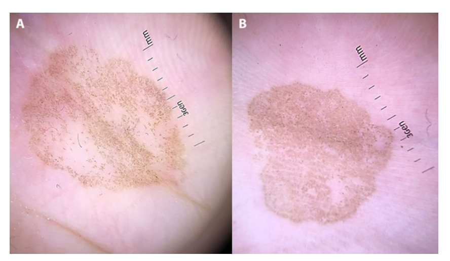
Figure 2. (A) "Brown spicules" forming an almost reticulated patch. (B) "Brown spicules" arranged in the parallel ridge pattern.