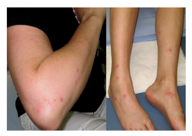
Figure 4. Clinical composite of images taken one week after biopsy showing a skin eruption consistent with scabies.

revealed a skin eruption consistent with scabies. Appropriate topical treatment was prescribed and the symptoms and signs of scabies resolved over a period of weeks. The source of infestation was not identified and no household member or other personal contact was reported to have developed symptoms prior, or subsequent to, this case.