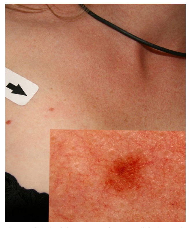
Figure 1. Clinical and close-up image of a pigmented skin lesion taken four months prior to biopsy.

The patient returned for her routine postoperative review one week after the excision. She now complained of an intensely itchy skin eruption and wondered if she was having an allergic reaction to the local anaesthetic or antiseptic skin preparation solution used at the time of surgery. Examination