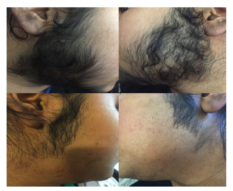
Figure 3. Hair reduction in a patient after 2 sessions of Nd:YAG laser hair removal.

In summary, the ruby laser (694 nm), alexandrite laser (755 nm), diode laser (800 nm), intense pulsed light source (550-1,200nm), and the Nd:YAG laser (1,064 nm), with or without the application of carbon suspension, work on the