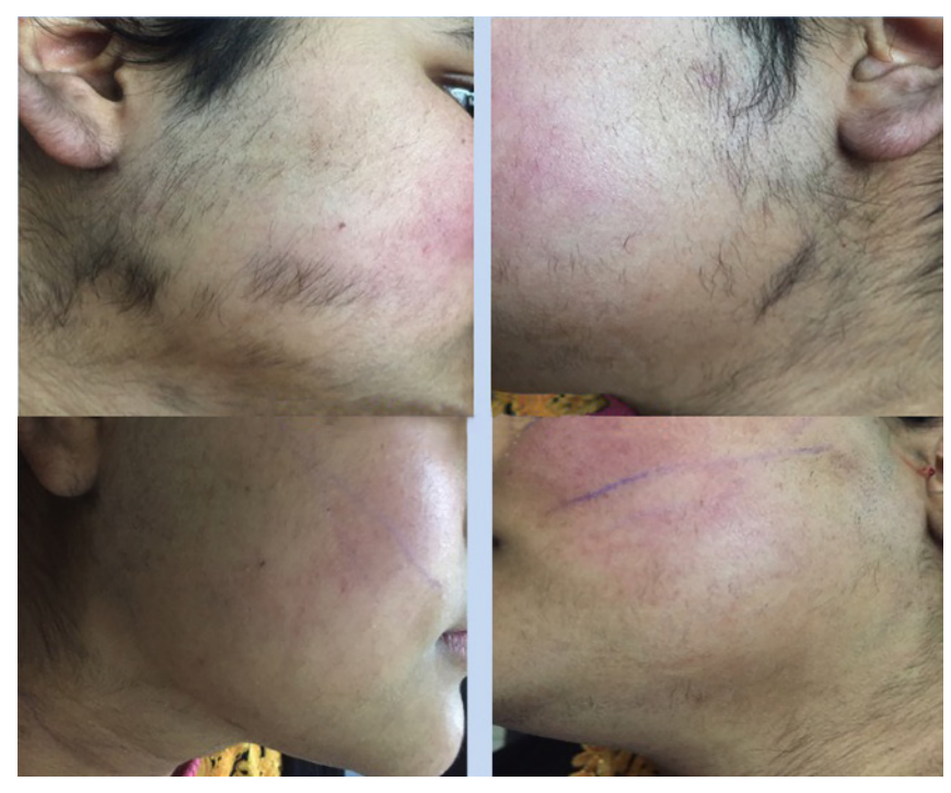
Figure 4. Significant hair reduction in the same patient after 4 and 6 sessions of Nd:YAG laser hair removal.

principle of selective photothermolysis with the melanin in the hair follicles as the chromophore. Multiple treatments are necessary to achieve satisfactory results regardless of the type of laser used. After repeated treatments, hair