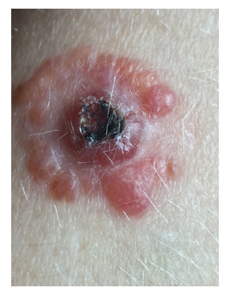
Figure 1. Multiple pinkish papules surrounding a main central tumoral lesion over the right forearm.

nosis. Furthermore, nevi in patients with OCA may have a similar dermoscopic pattern to that described for amelanotic melanoma [1].