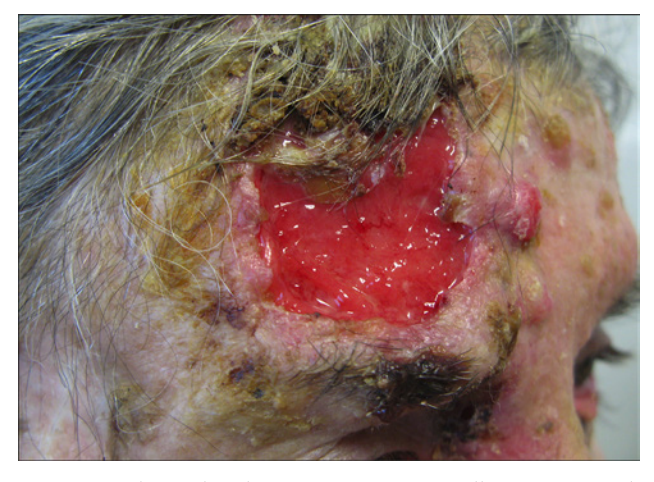
Figure 1. Advanced and recurrent squamous cell carcinoma with nodal involvement in an elderly woman with dementia and chronic myeloid leukemia. Large ulcerative and keratotic tumor with numerous actinic keratosis and satellite nodular lesions on the surrounding skin. She presented with locoregional lymph node involvement on parotid homolateral region.

allowing better recognition and a more precise selection of suspicious areas to biopsy, and provide a noninvasive, accurate way to monitor treatments. Moreover, the therapeutic intervention on the cancerization field in patients with severe actinic damage and multiple in situ/low-risk SCC, and the development of innovative treatments such as epidermal growth factor receptor inhibitors and immune checkpoint inhibitors for locally advanced and metastatic SCC, are improving considerably the approach to the disease.