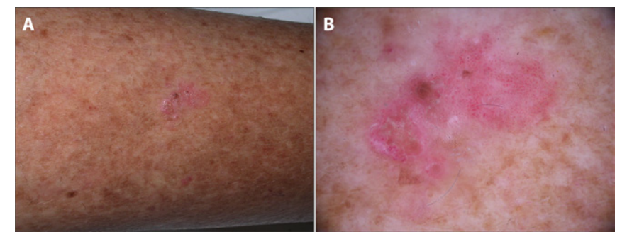
Figure 4. (A) Clinical image of Bowen disease. (B) Dermoscopic image of Bowen disease where clusters of glomerular and dotted vessels and whitish scales can be identified.