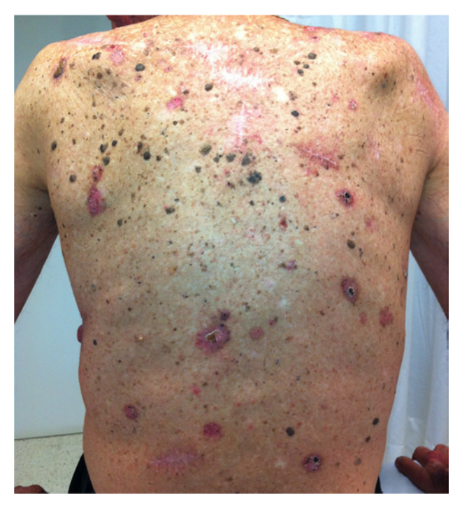
Figure 2. Multiple skin cancers, mainly squamous cell carcinomas, in a solid organ transplant patient.

Dermoscopy is a noninvasive diagnostic technique that allows in vivo evaluation of colors and microstructures of the epidermis, the dermoepidermal junction, and the papillary dermis at 10-fold magnification [1], which improves diagnostic accuracy for SCC compared to inspection by the