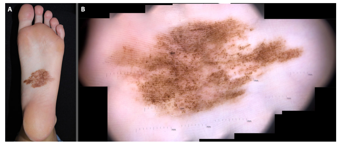
Figure 1. (A) Congenital melanocytic nevi measuring 6.3 \times 3.4 cm located on the plantar area in a 23-year-old patient. (B) Wide area digital dermoscopy obtained from merging of 20 separate dermoscopic images (DermLite DL4 3GEN Inc., San Juan Capistrano, CA, USA; attached to a smartphone; polarized, magnification \times 10 ).