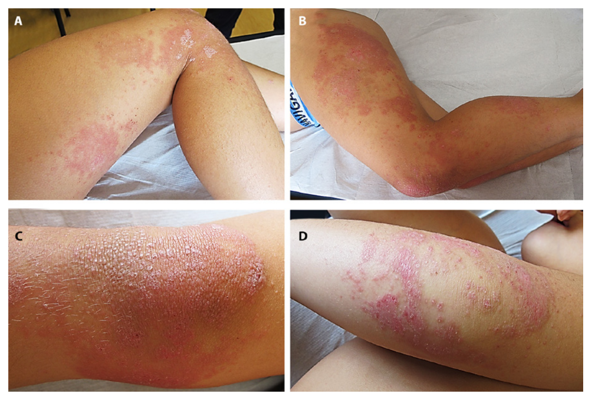
Figure 1. (A,B) Follicular and nonfollicular erythematous and hyperkeratotic papules merging into red hyperkeratotic patches/plaques on the outer side of the legs. (C) Purple plaques with hyperkeratotic papules on the knees. (D) Erythematous desquamating patches on the elbows.