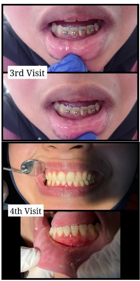
Figure. 2. The appearance of the patient's lower labial mucosa on the third and fourth visits

Fourth Visit (June 29, 2022): 1) The ulcer on the left side has been completely healed, with no pain or scar. 2) DHE. 3) Patients were educated about consuming nutritious food daily to support oral and overall body health.