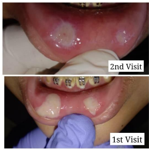
Figure. 1. The appearance of ulcers on the patient's lower labial mucosa on the first and second visits

Second Visit (June 15, 2022): 1) The patient came for post-therapy control, which was done for a week. The ulcer was no longer too painful; the diameter was smaller, although it had not healed completely. 2) Only the ulcers were cleaned and treated again like the first visit because the patient did not want to remove the orthodontic appliance. 3) The wound area was cleaned using a 1.5% hydrogen peroxide solution to remove debris covering the ulcer. Then, the ulcer area was dried and isolated using cotton rolls. 4) 10% povidone-iodine was applied to the ulcer margin area. 5) 0.1% Kenalog was applied in oral base paste on the surface of the ulcer using a cotton pellet or micro applicator. 6) The cotton rolls were removed, and the patient was instructed not to eat, drink, or rinse for 30 minutes after applying the Kenalog. She was only allowed to spit if it felt uncomfortable. 7) The patient was instructed to continue taking the prescribed medication and vitamins regularly. 8) The patient was instructed to return for ulcer control and evaluation one week later. 9) DHE.